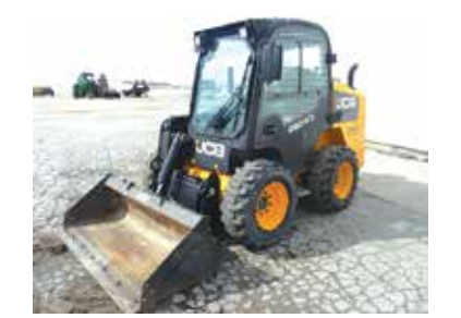
'14 JCB 260ECO W/ONLY 700 HRS! SEV- ERAL MORE SKID STEERS COMING!

AUCTION NOTE: Buyers, plan to attend as the auction is growing daily! Consignors, take advantage of a strong market with a worldwide buying audience and ALL TIME HIGH PRICE RESULTS! Watch for complete details, auction listings and photos, as well as sale catalogues that will be provided by equipmentfacts.com and proxibid.com. Phone (920) 989-4000 for assistance and details!