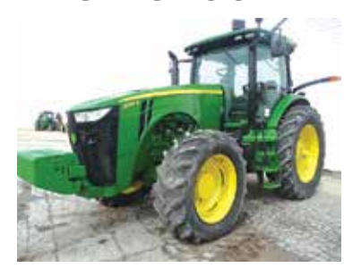
JD 8235R MFWD, ONE OF APPROX. (50) TRACTORS SELLING!